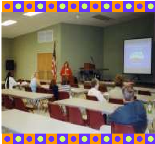
Choctaw County Community Center

Choctaw County's most elegant meeting facility is now open!