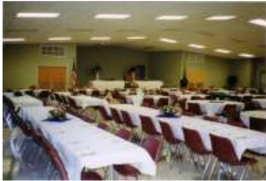
Choctaw County Community Center

Features of the new community center include: